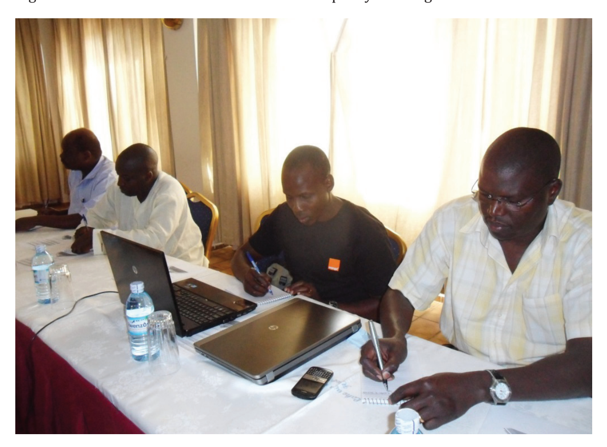
A section of staff attending an organisational development workshop at Lake View Resort Hotel, Mbarara

The Commission also held a Senior manager's competence workshop at Silver Springs Hotel, Bugolobi on 28<sup>th</sup> and 29<sup>th</sup> November 2012 for capacity building.