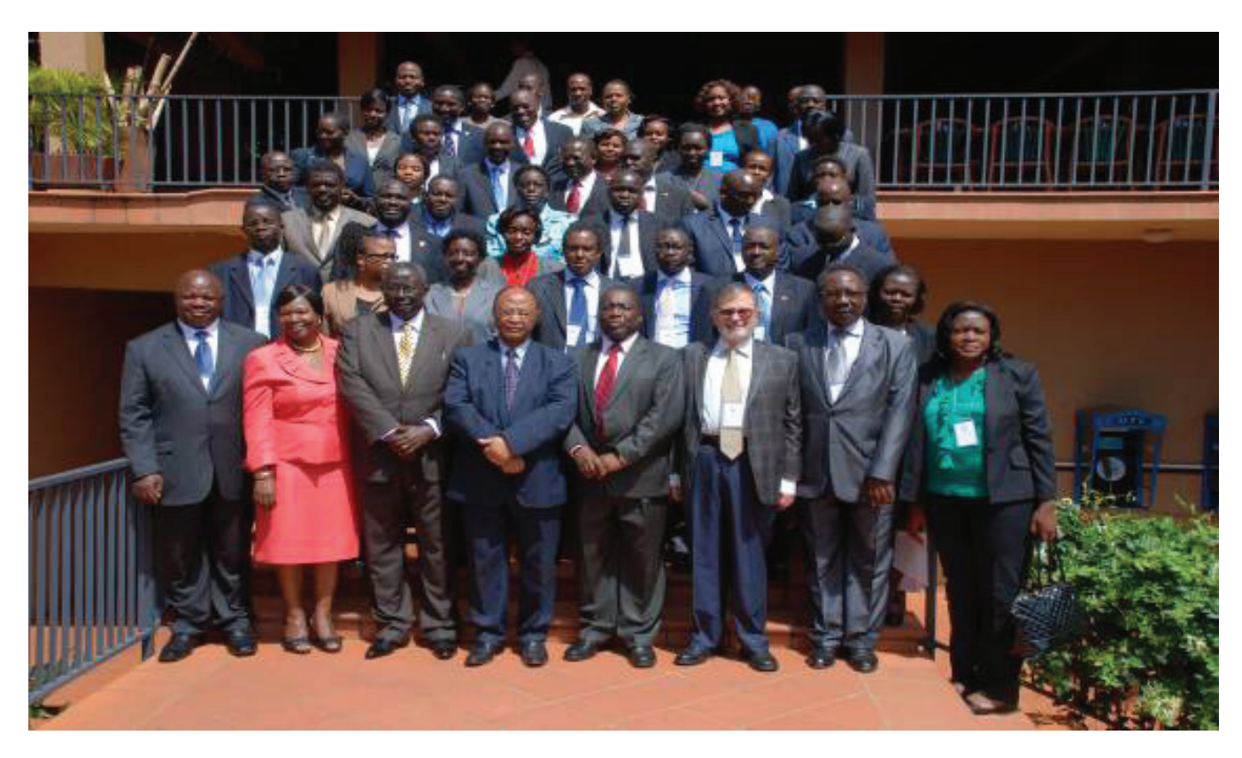
Delegates at the business law conference