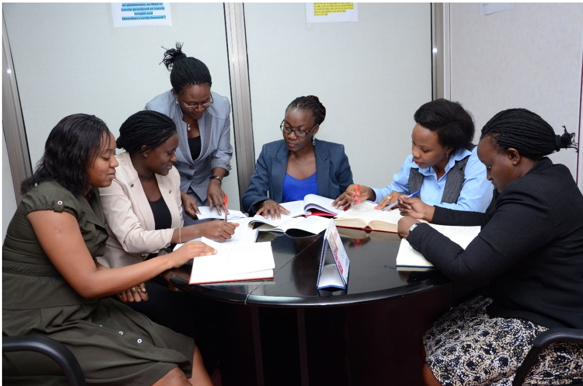
A team on major revision during a proof reading exercise.

A legal audit of subsidiary laws contained in the 2000 edition was undertaken and the commencement of the revision of subsidiary laws is planned for the FY 2015/16.