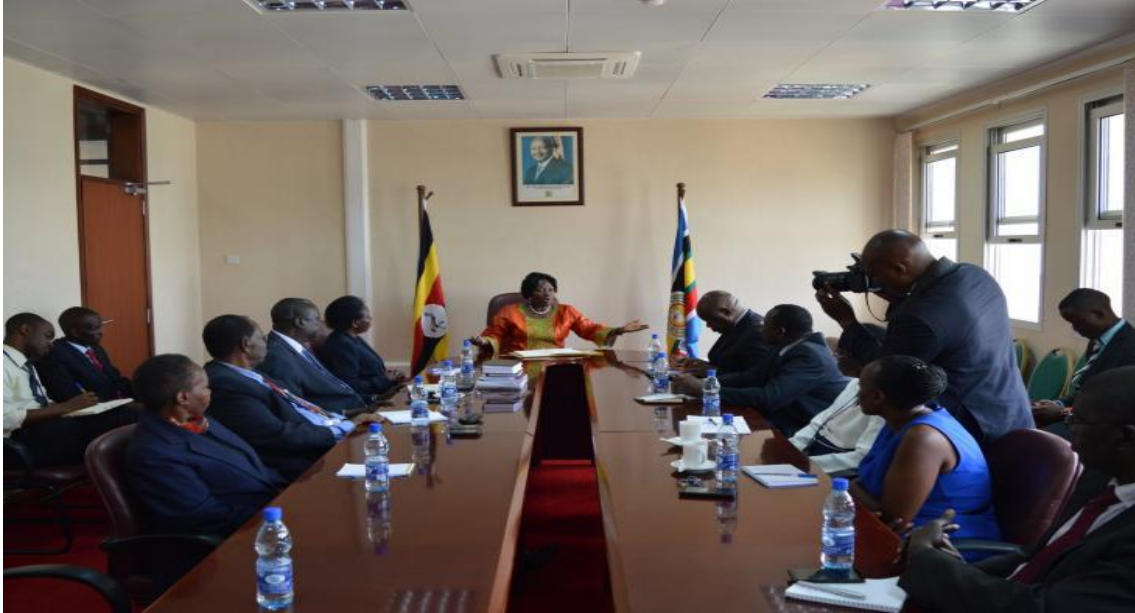
Members of the Commission meeting the Speaker of Parliament