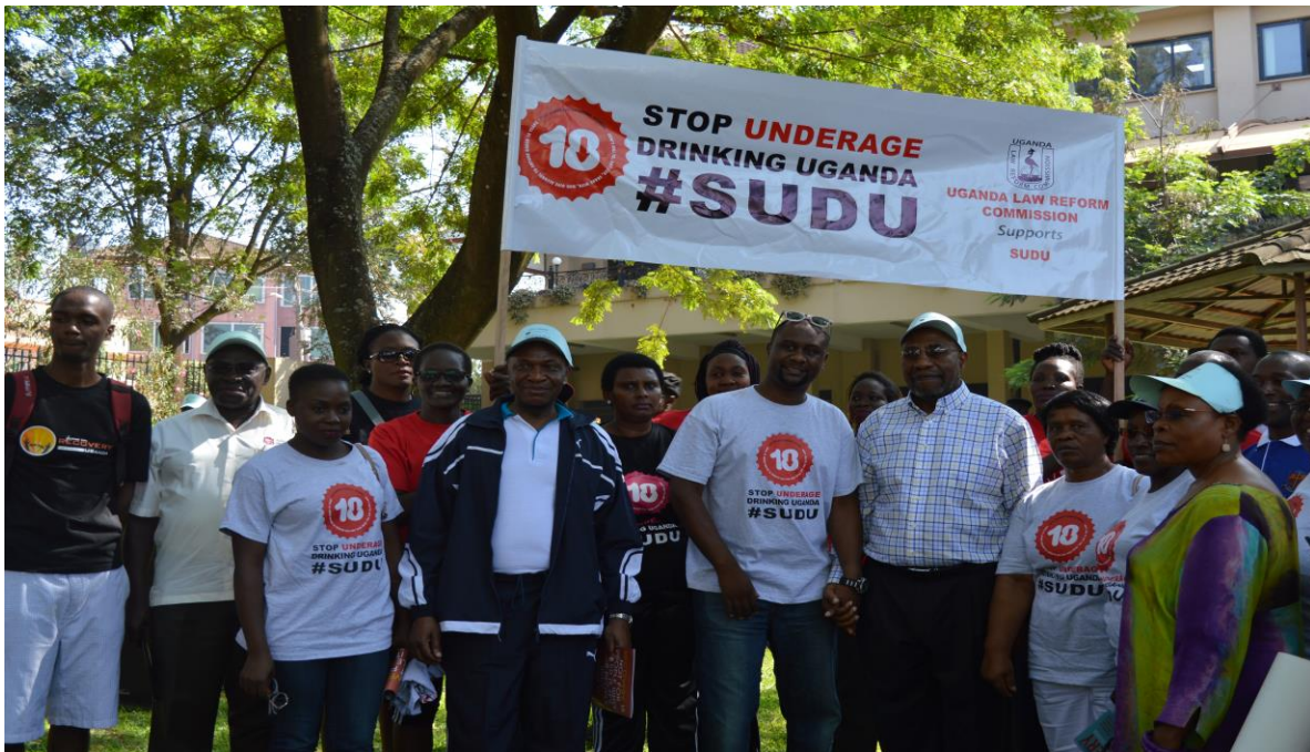
Members of staff joining the Rt. Hon Prime Minister and other SUDU stakeholders in a recovery walk